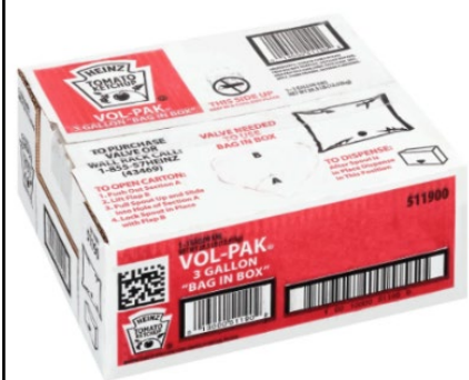
Heinz Ketchup Vol-Pak, 3 Gallon

INGREDIENTS: TOMATO CONCENTRATE FROM RED RIPE TOMATOES, DISTILLED VINEGAR, HIGH FRUCTOSE CORN SYRUP, CORN SYRUP, SALT, SPICE, ONION POWDER, NATURAL FLAVORING.